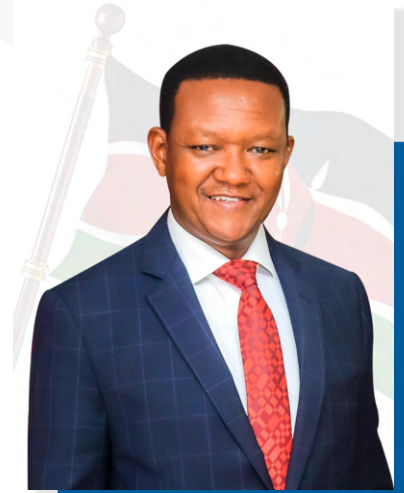
DR. ALFRED MUTUA

WELCOME MESSAGE FROM DR. ALFRED MUTUA, CABINET SECRETARY FOR TOURISM AND WILDLIFE, KENYA